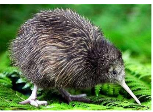
This is a real kiwi.