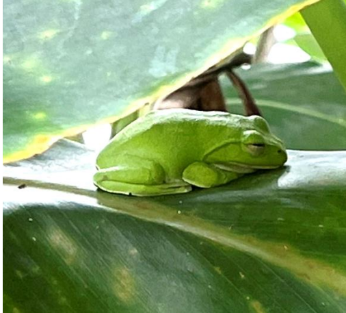
Taking an afternoon nap

When I was a kid, I loved to be outside and catch bugs in my front yard. In college, I even took an insect class, and I discovered my new favorite insect: the