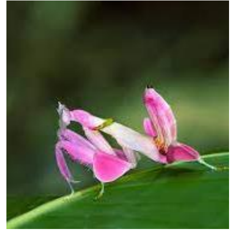
My favorite insect: The Orchid Mantis

orchid praying mantis! Last month, I was reminded of these memories when I visited Gunma Insect World.