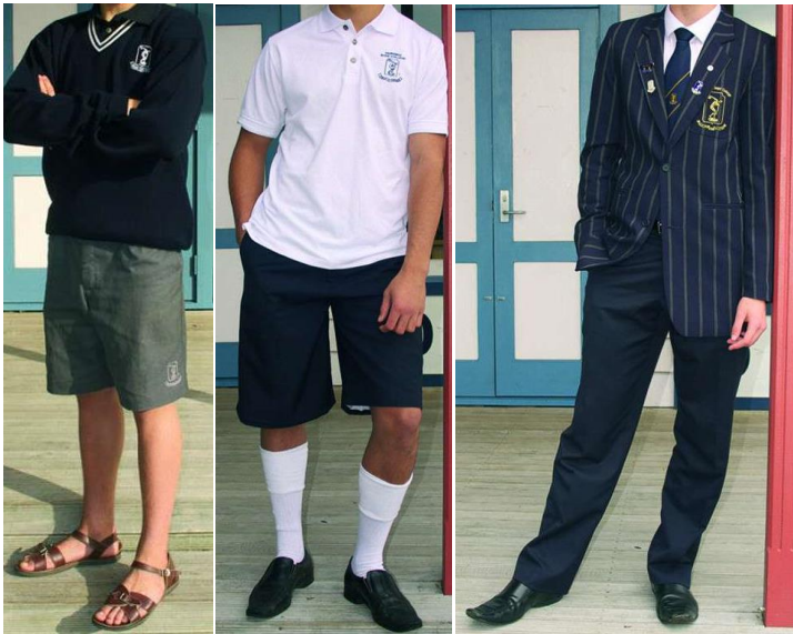
Junior, senior summer, and senior winter uniforms

And I think our uniforms don't look as good as the uniforms in Japan. You have the famous gakuran and sailor-style uniforms , which I think look much smarter. For me, my uniform was a blue polo shirt, grey shorts, and grey knee-high socks. Very un-cool indeed. Then in the last year of high school, we could wear a white polo shirt, and blue shorts in summer, or a white shirt and tie with a blazer and black trousers in winter. I will admit that I'm glad I could wear shorts in summer, though.