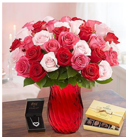
Romantic gifts for Valentine's Day (heart necklace, flowers, and chocolates)

Many people in the United States give gifts not only to romantic partners, but also to classmates, friends, teachers, and family. However, some gifts are more romantic than others. Boys may give girls roses or jewelry, or they may go to a nice restaurant. Red roses are one of the most popular flowers to give because they represent love, romance, and passion. Earrings and necklaces are also great gifts that people give to their romantic partners.