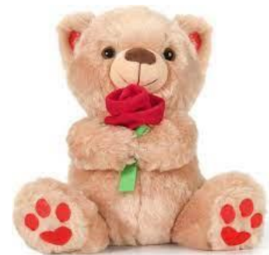
Valentine's Day plush

All around the world, people buy gifts to give on February 14 th to celebrate Valentine's Day, the holiday of love and romance. Here in Kiryu, Valentine's chocolates were being sold in stores like Yaoko and 7-Eleven, and some people might have made chocolate for their friends. In the U.S., people also buy chocolate to give to friends, however, we also give other gifts too!