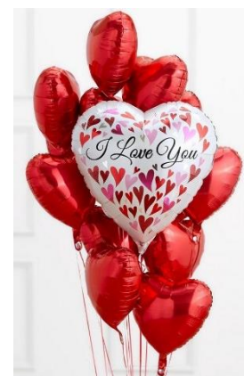
Valentine's Day balloons

Many people in the United States give gifts not only to romantic partners, but also to classmates, friends, teachers, and family. However, some gifts are more romantic than others. Boys may give girls roses or jewelry, or they may go to a nice restaurant. Red roses are one of the most popular flowers to give because they represent love, romance, and passion. Earrings and necklaces are also great gifts that people give to their romantic partners.