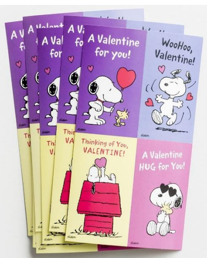
Snoopy Valentine's Day cards

Some people also give other gifts such as balloons. When I was a high school student, I would see classmates carrying large balloons and plushies (縫いぐるみ) around school every year on Valentine's Day!