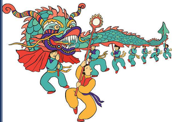
The Dragon Dance

you add them to the dish. Once everything is assembled, everyone yells "Happy new year!" and makes wishes for the coming twelve months, while tossing the food up in the air. How exciting!