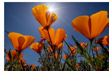
California poppies in Southern California

The last super bloom in California was in 2019, so locals and tourists are very excited to see this year's blossoms. Many people are visiting California this year to see the bright yellow, orange, blue, and purple flowers. People can see the blooms all throughout the state, from the Bay Area (San Francisco) in Northern California, to Los Angeles in Southern California. One flower many people will see