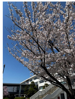
Welcome to Kiryu High School!