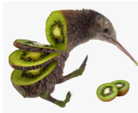
This is not a kiwi.

It's very cute, don't you think? Also, New Zealanders are commonly called "Kiwis", so I decided to give the name "Kiwi Corner" to my section of this monthly journal.