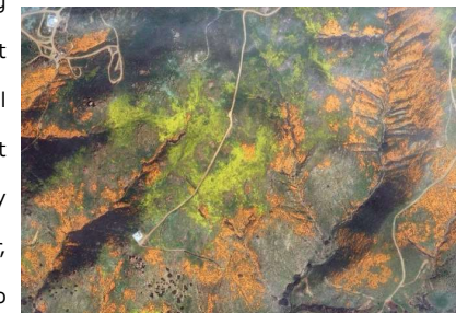
A picture of the 2023 super bloom from space

Hello everyone! I hope you all had a wonderful spring break and are ready to do your best this school year! To start off this year's English journal, I want to talk about the beautiful spring flowers in California. Specifically, I'm going to talk about California's super bloom ! A super bloom is when many wildflowers bloom at the same time. It rained a lot this winter, so this year's super bloom is very special. In fact, there are so many flowers blooming this year that they can be seen from space! How cool is that!