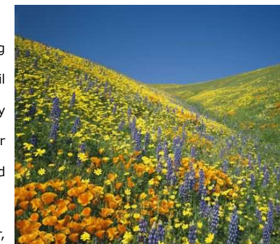
A picture of the super bloom in the Antelope Valley California Poppy Reserve

For this month's journal, I would like to introduce a song about sunshine. Please enjoy! https://www.youtube.com/watch?v=XEhc5ZQ5er0