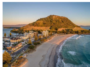
The beaches in Tauranga.

My hometown is a city called " Tauranga ." It is slightly bigger than Kiryu, and it is famous for its beautiful beaches . Tauranga is also famous for kiwifruit, and the kiwifruit company Zespri is based there. If you ever get the chance, please visit!