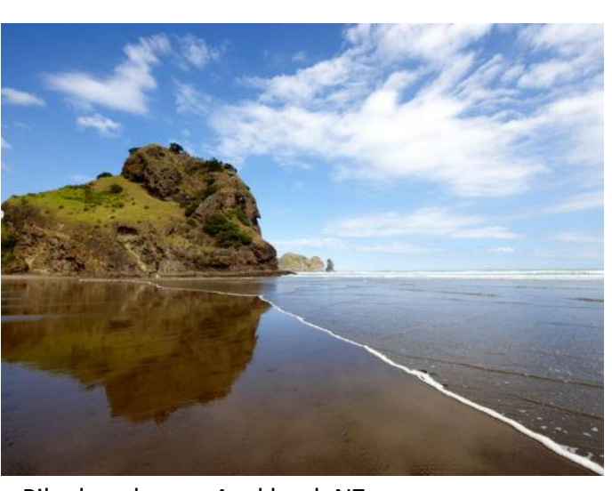
The beach in my hometown, Tauranga.

Just like Japan, New Zealand is an island nation, and has many beautiful beaches. Typically, the west side, which faces the Tasman Sea, has beaches with darker sand, and the east side, which faces the Pacific Ocean, has beaches with glorious golden white sand. However, as New Zealand is so close to Antarctica, the water is quite cold , even in the middle of summer! Most people wear "togs" (as swimsuits are called in New Zealand), but some people even wear wetsuits as it is so cold.