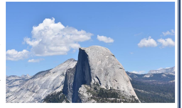
Half Dome at Yosemite National Park

Summer vacation is finally here! The weather is warm, the insects are flying about, and the time is right for adventure. Now that you have all finished first term, maybe you will go camping with your family or visit a place to enjoy beautiful scenery. In the U.S, there are many great places to enjoy nature in all its forms. Some of the best places to go are the famous U.S national parks.