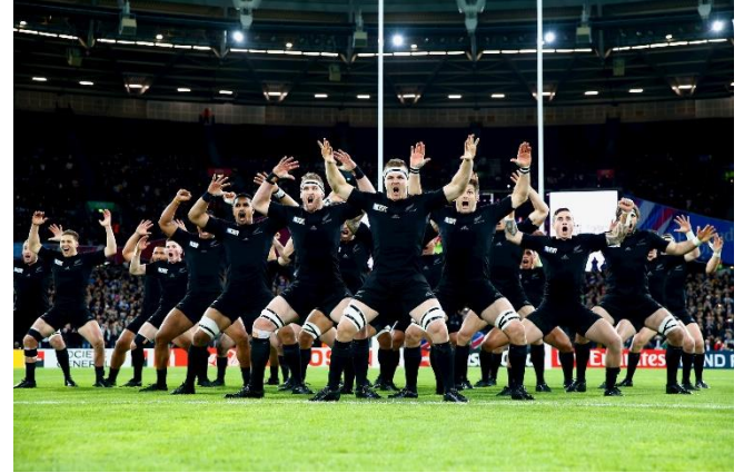
The world-famous All Blacks' haka .

Coming from New Zealand, I grew up watching rugby and cheering for my country's team, the All Blacks , which many of you may know because of their world-famous haka or ceremonial dance that is performed before each match. I also knew that rugby was played here in Japan, as your national team, otherwise known as the Brave Blossoms , often played in world cup matches.