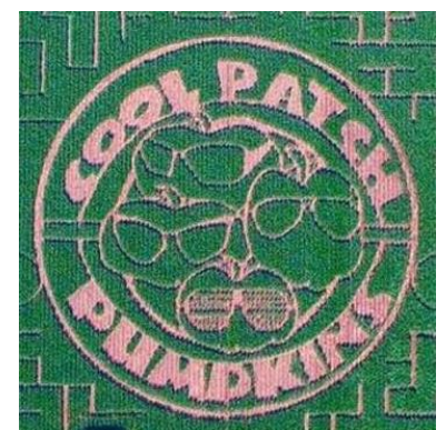
Cool Patch Pumpkins' logo.