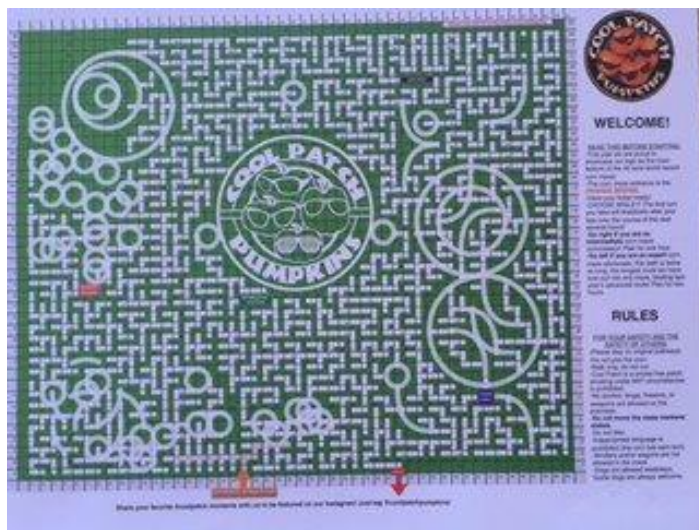
A map of one of Cool Patch's corn mazes.

From the end of September until October 31 st , Cool Patch Pumpkins opens a corn maze to the public. Since 2001, unique mazes have been made every year for visitors to test their map reading skills. This maze has been featured as the largest corn maze in the world in the Guinness Book of World Records twice, once in 2007 and then again in 2014. In 2014, the maze was a whopping 63 acres (over five times the size of Tokyo Dome)! Now that is a lot of corn. According to Cool