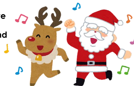
Santa having a jolly old time with his reindeer

Firstly, there is the obvious reindeer . There is no animal more representative of Christmas than the trusty reindeer. The origin of the image of Santa's sleigh and his reindeer comes out of "The Night Before Christmas." It's commonly believed the first symbols of flying reindeer helping Saint Nicholas appear here.