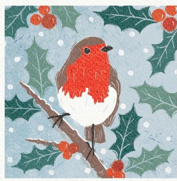
A robin on a Christmas card

The next animal I'd like to introduce is a bird called the robin . Throughout the English winter, the robin is a treasure. Victorian-era postmen even had the nickname "robin," as they wore bright red jackets. The sight prompted a series of images of red-breasted birds delivering mail during the holidays. American robins are also familiar sights. The bird is famous for its cheery singing and brightly colored chest.