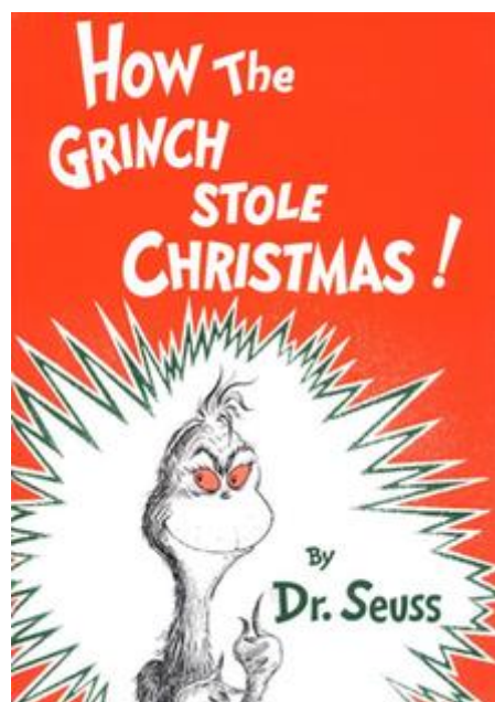
The cover of "How the Grinch Stole Christmas" by Dr. Seuss

The second story I want to share is called "How the Grinch Stole Christmas". The first rendition of this story was written by Dr. Seuss and published in 1957. is a tale of a green creature who lives alone on a snowy hill outside of a town called Whoville. This creature, the Grinch, is bitter and hates everything about Christmas. As December 25 th approaches, the townspeople of Whoville are preparing for a fun and happy Christmas Day. The Grinch doesn't like the idea of anyone enjoying Christmas, so he comes up with a plan. On the night before Christmas, he decides to disguise himself as Santa Claus and slinks down towards the sleeping town of Whoville. Moving in the shadows, he steals all of the Christmas gifts and decorations he can find, and goes to sleep proud of his work. Does he succeed in ruining Christmas? Or will he have a change of heart? You can listen to the story here: https://www.youtube.com/watch?v=ZVgHGodD5wY