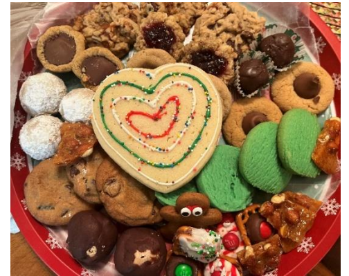
My neighbor's Christmas cookies

While I was home, I also ate a lot of delicious food! From California burritos to Fettuccine Alfredo pasta, I had a great time eating some of my favorite foods from home. On Christmas day, I enjoyed a turkey dinner and pumpkin pie with my family. My neighbor even brought us some Christmas cookies! One day, I even went to a British tea venue to try some fancy teas and assorted dishes. It was such a fun experience getting to eat different savory and sweet treats from a three-tier tray (also known as a "curate").