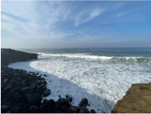
A picture I took at Sunset Cliffs

Happy New Year everyone! I hope you all had a wonderful winter vacation and were able to take time to see some Christmas illuminations and enjoy some winter festivities! As we start the new year, I'd like to share about my winter vacation with you all, for this year I was able to go back home to San Diego.