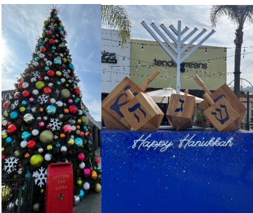
Holiday decorations at a nearby mall

Besides eating delicious food, I also drove to quite a few places. One day I went shopping at the mall and saw their winter holiday decorations. Also, I traveled with a friend to Los Angeles and saw a play called "A Christmas Story." We even stopped at a Round One and I won a Pochacco plushie (ぬいぐるみ)!