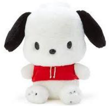
A Pochacco plushie

Besides eating delicious food, I also drove to quite a few places. One day I went shopping at the mall and saw their winter holiday decorations. Also, I traveled with a friend to Los Angeles and saw a play called "A Christmas Story." We even stopped at a Round One and I won a Pochacco plushie (ぬいぐるみ)!