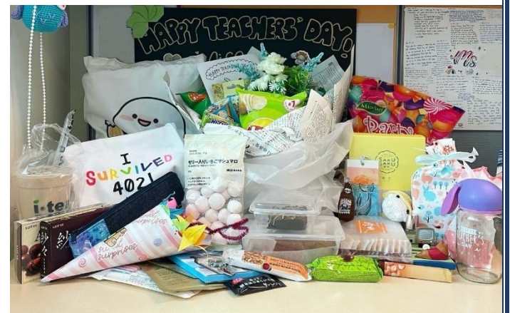
A teacher's desk in Singapore on Teacher's Day.

On the other hand, Singapore has an official school holiday held on the first Friday of September. Celebrations are usually conducted the day before, where students usually get half the day off. High school students are also allowed to visit their junior high and elementary schools to thank their former teachers as well. It was designated on the first Friday of September to coincide with the upcoming September school holidays (one week) so that students and teachers can enjoy an extended break.