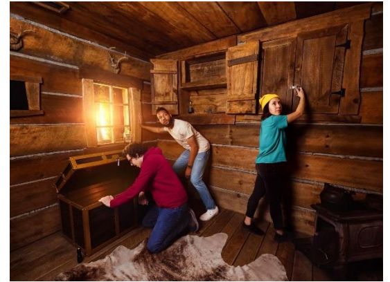
An example of an escape room.

Have you ever been in an escape room before? If you have, then you know they are usually centered around a theme such as adventure, horror, fantasy, or mystery. These rooms are full of puzzles you and your friends need to solve within about 60 minutes. Rooms vary in difficulty, from easy, to moderate, to difficult, so if you're a beginner, you can start with easier rooms before trying more challenging ones.