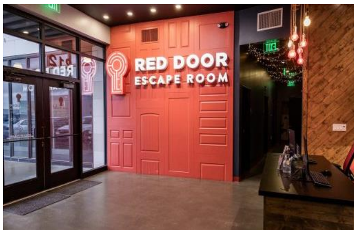
The entrance to Red Door Escape Room in San Diego.

When you arrive at an escape room, the employees will welcome you in, check your reservation and ask you to put your belongings in a locker. They will go over the rules of the game and then guide you to your room. They give you one last reminder that you have 60 minutes to escape, and then the game begins!