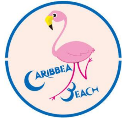
A fun place to cool down in Kiryu

Hi, everyone! I hope you are staying cool this summer with shaved ice, air conditioning, and plenty of water! Maybe you'll even go to Caribbean Beach in Kiryu! In Southern California (SoCal), we also have water parks like Caribbean Beach. An average water park in Cali has water slides, attractions, pools, food, and more. In fact, it's estimated there are about 30-50 water parks in all of California! Today, I'd like to introduce a couple of these parks to you. Let's