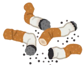
Cigarette ends are a problem in New Zealand

New Zealand also has a "clean, green" image, and the littering of the ends of cigarettes is recognised as a pervasive issue. In the National Litter Audit conducted in 2019, the ends of cigarettes were the most commonly found items.