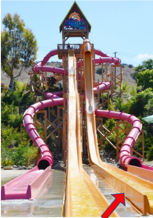
I went on this slide at Aquatica!